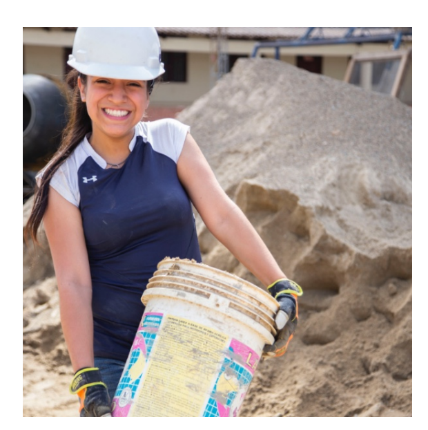
Maranatha Volunteers International's annual mission trip for high-school teenagers, Ultimate Workout, recently finished its 28th generation in Bolivia. A total of 167 teens and adults served at four locations in the