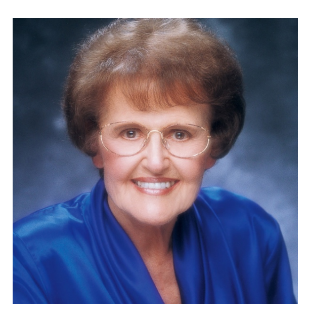
Supporters of Adventist higher education now have additional opportunities to help students pay for