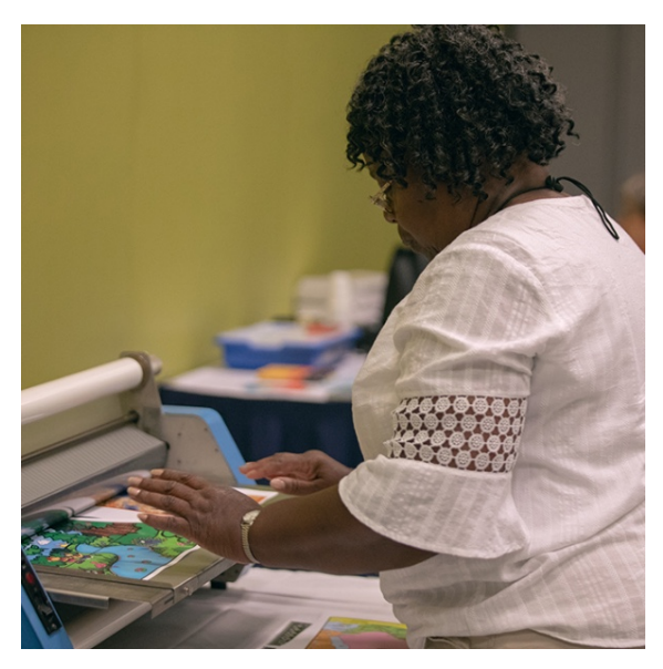
For three days in August, a room in the south building of McCormick Place was filled with reams of paper, five laminators, colored pencils, pairs of scissors — and 240 Adventist educators attending the NAD Teachers' Convention. Multi-grade teachers of small schools had the opportunity to color, laminate, and trim all the resources for five units of the new Encounter Bible curriculum. MORE